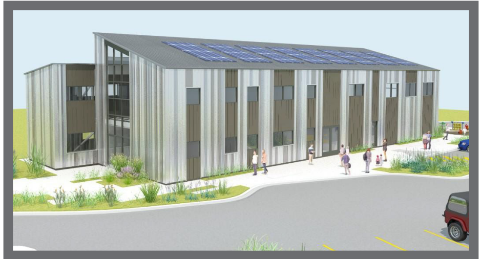
Architectural rendering of the new building.