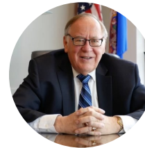
Senator David H. Senjem State Senator who has supported dyslexia-friendly legislation