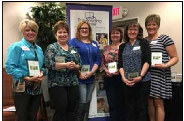
Group of tutors celebrating their one year of service to The Reading Center

We offer our Basic Orton-Gillingham Training Institute three times a year online and twice per year in Rochester. This 120-hour course provides an in-depth training on the structure of the English language and the Orton-Gillingham approach. It includes a practicum component to fine-tune your skills on real students with Master Teacher supervision. Successful graduates of this program are able to work with students through fourth grade. Register for our Institutes on our website. Scholarships and tuition reimbursements are available.