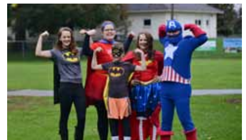
Great to see so many costumes this year at the Dash!