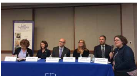
1000+ attend our Dyslexia Laws Panel on Oct 10